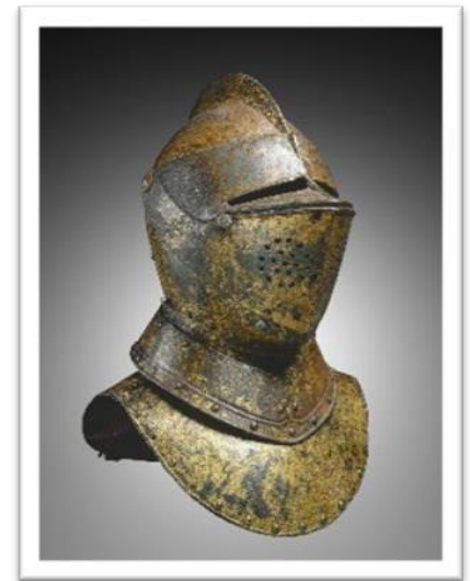
"ane cellat and ane gorget" one light helmet and an iron collar

ane burdeclaith with canwes of 9 eln – one broadcloth, 9 ells (1ell=3'1", 6 ells=1 fall) of canvas.